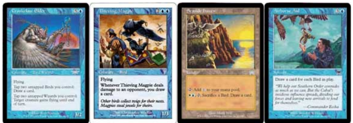
Draw a card, draw a card, draw a card... Who knew birds were so smart?

I'm no speciesist. I'm not prejudiced against platypuses because they're platypuses or chinchillas because they're chinchillas. I believe in the whole Noah's Ark rainbow. But if you asked me what the most studious, research-minded race on Dominaria was, "bird" would not be my first guess. I'd probably have gone with, oh, I don't know, people. I've known people for most of my life, and they're generally more into the whole reading thing than parakeets and cockatoos are. In Magic terms, wizards. Nope. Not cephalids either. Birds.